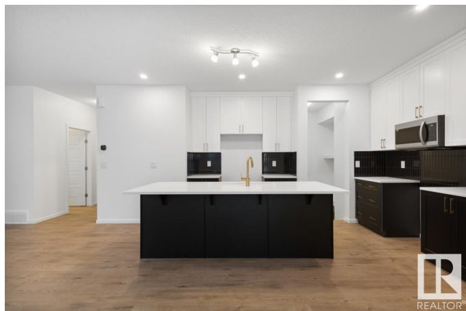
37484026 – Interior Selection Photo – Main Floor

MLS® # E4428135 Price $647,990 Bedrooms 4