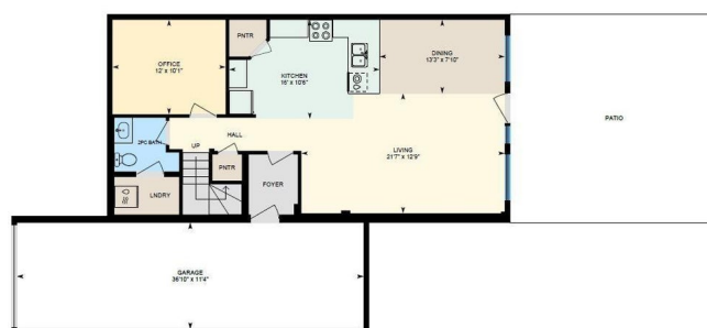
Main Floor: Interior Area 856.69 sq ft Excluded Area 415.67 sq ft